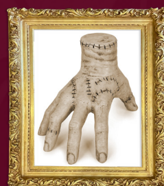
'THING' ELLIOTT SANDBROOKE