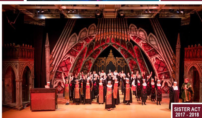
SISTER ACT 2017 - 2018