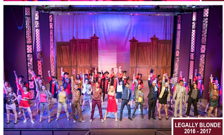
LEGALLY BLONDE 2016 - 2017