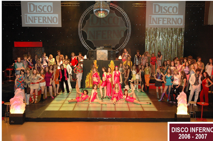
DISCO INFERNO 2006 - 2007