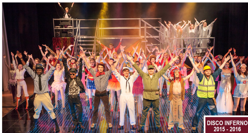
DISCO INFERNO 2015 - 2016