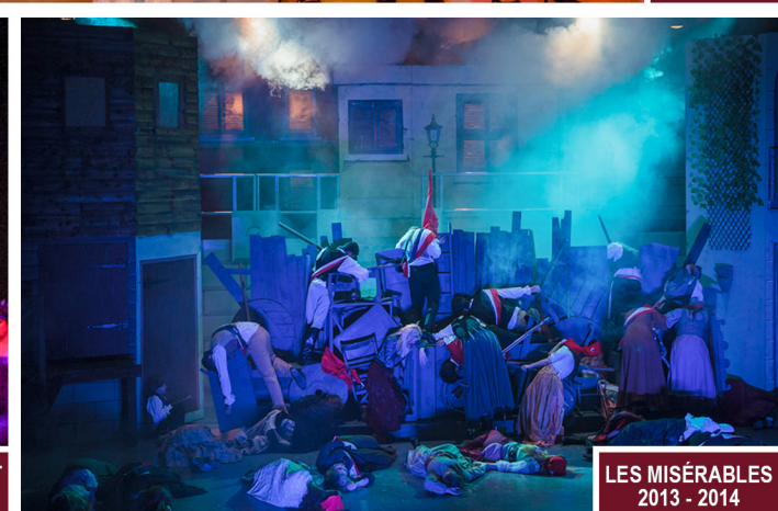
LES MISÉRABLES 2013 - 2014