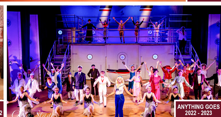
ANYTHING GOES 2022 - 2023