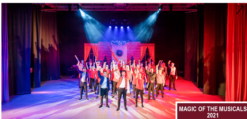
MAGIC OF THE MUSICALS 2021