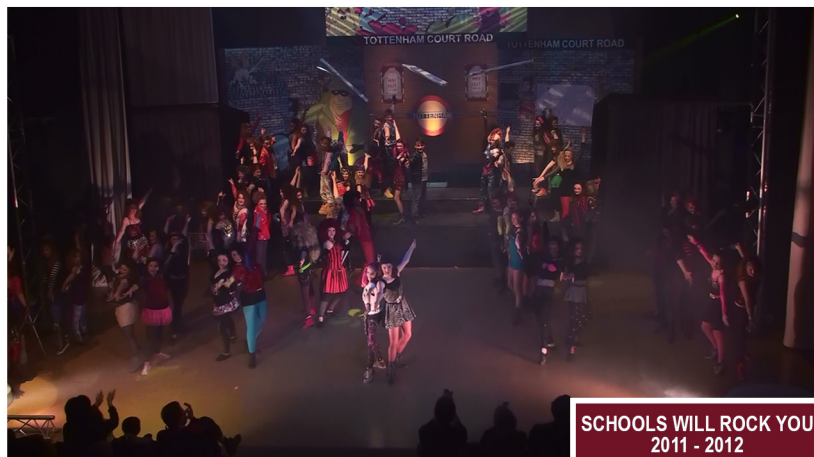
SCHOOLS WILL ROCK YOU 2011 - 2012