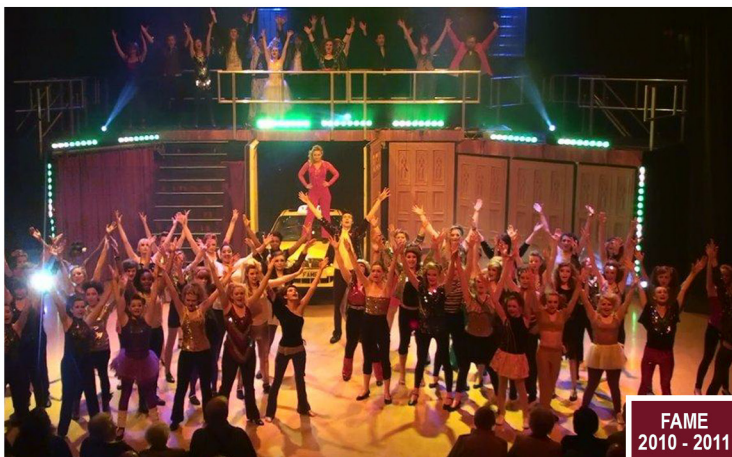
FAME 2010 - 2011