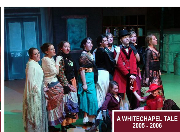
A WHITECHAPEL TALE 2005 - 2006