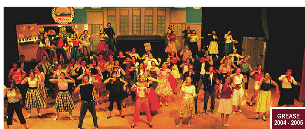
GREASE 2004 - 2005