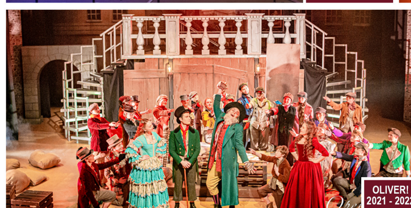
OLIVER! 2021 - 2022