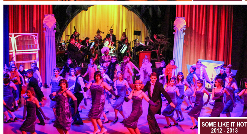
SOME LIKE IT HOT 2012 - 2013