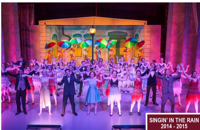
SINGIN' IN THE RAIN 2014 - 2015