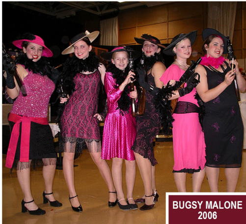
BUGSY MALONE 2006