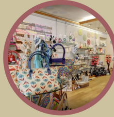
GIFT & HOME