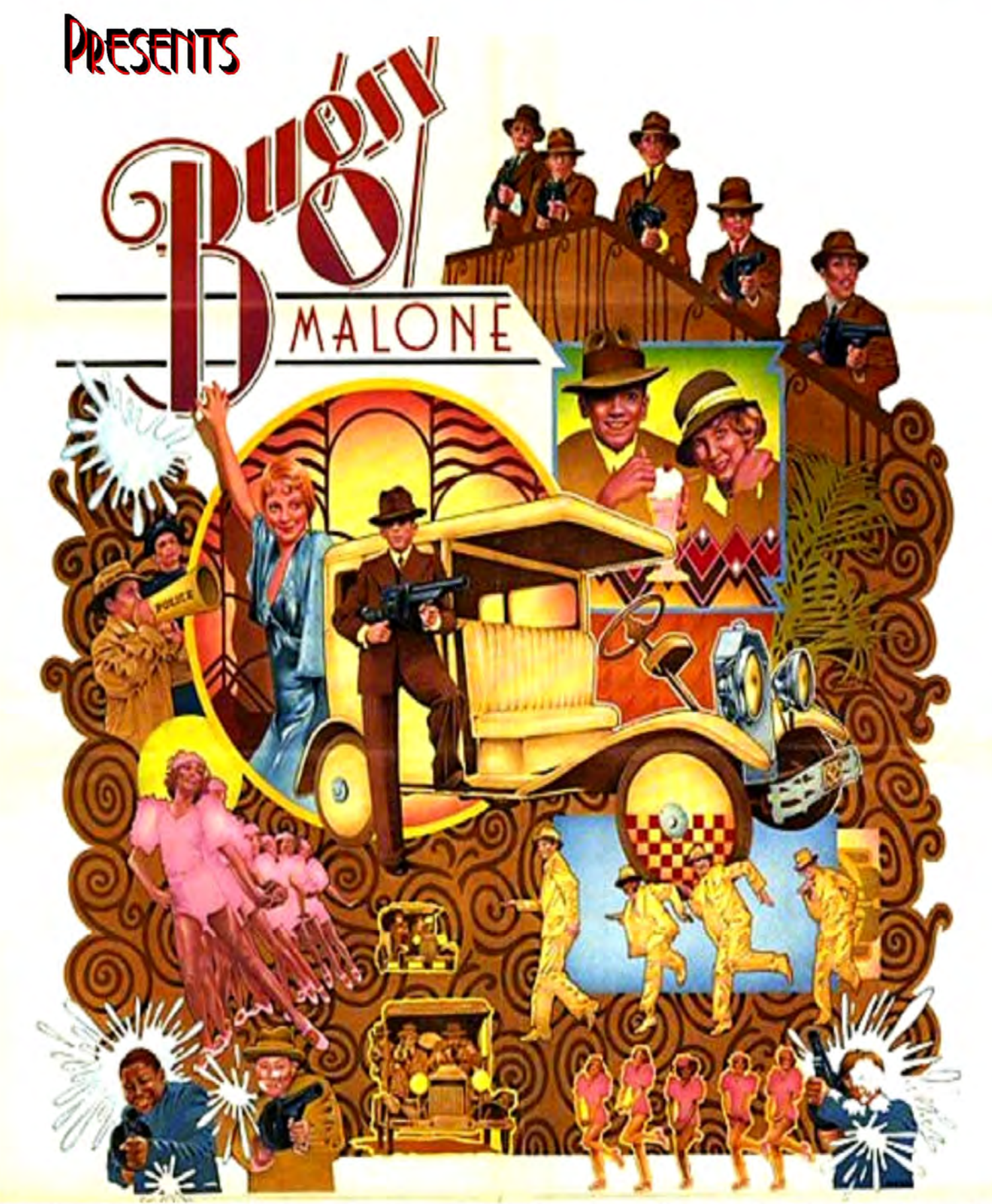
At the Performing Arts Centre, Hinchingbrooke Park Rd, Huntingdon 25th-28th October 2006